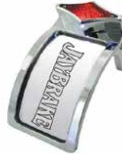
Standard Light Radial Plate Mount