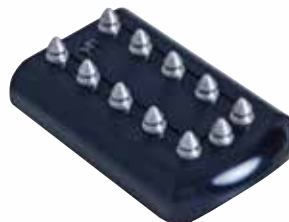
FX Brake Pedal