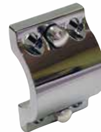
2 Button Switch Clamp See pg. 160