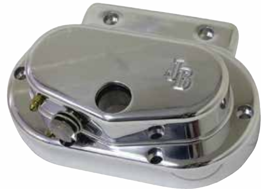
Hydraulic Transmission Cover

This low profile cover easily converts standard cable clutch to hydraulic. Features a sight glass, a hidden banjo bolt and bleeder. Hand controls not included. Comes w/ banjo bolt J-300-8.