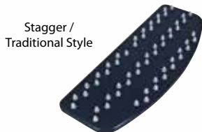
Stagger / Traditional Style