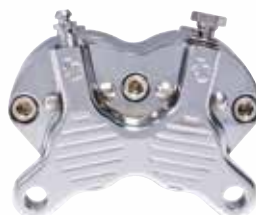
Radial w/ ears