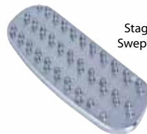
Stagger / Swept Style