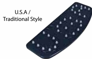
U.S.A. / Traditional Style