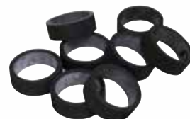
Peg Rubber Replacements