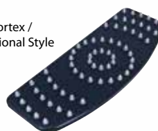
Vortex / Traditional Style