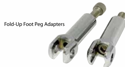
Fold-Up Foot Peg Adapters