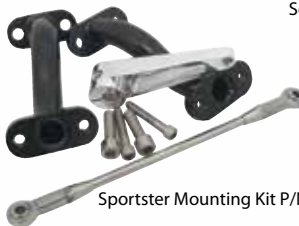
Sportster Mounting Kit P/N J-100-46