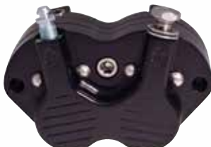
Radial w/o ears