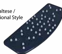
Maltese / Traditional Style