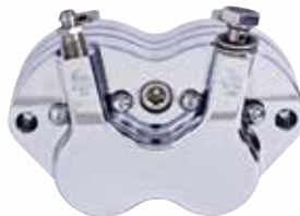
Smooth w/o ears