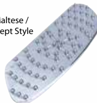
Maltese / Swept Style