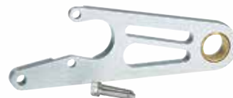
J-370-4161, J-300-4161, J-303-4161, J-373-4161