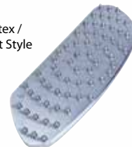
Vortex / Swept Style